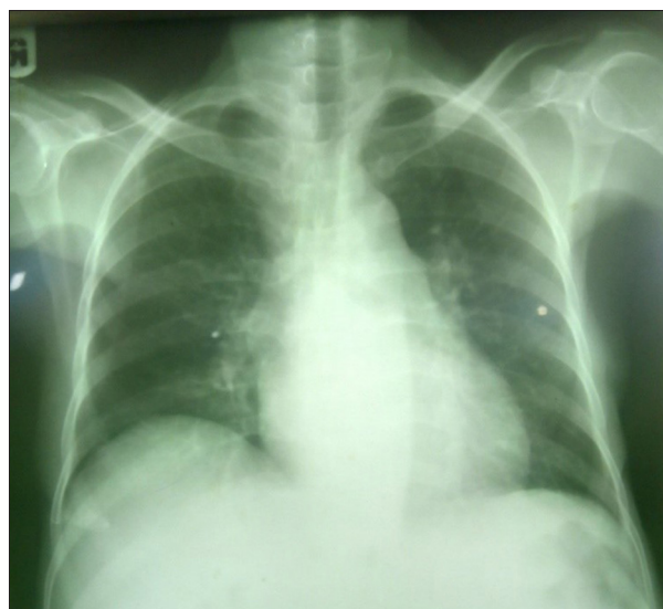
Figure 2. Chest X-ray of the patient.

WBC – white blood cells; HbsAg – hepatitis B surface antigen; HCV – hepatitis C; HIV – human immunodeficiency virus.