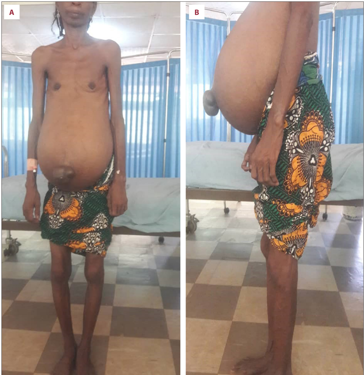
Figure 1. (A, B) Typical egg-on-stick appearance of index case. Markedly distended abdomen with visible distended superficial veins and gross ascites that is disproportionate to the size of lower limbs (very thin legs) with no pitting edema.

ventricular chambers was seen. The LV ejection fraction was 66% and fractional shortening was 30%, transmitral early/late ratio of 1.9, deceleration time of 150 ms, and isovolumetric relaxation time of 55 ms. Severe tricuspid regurgitation with tricuspid valve regurgitant jet area of >10 \text{ cm}^2 and mild mitral and pulmonary regurgitation with pulmonary arterial systolic pressure of 40 mmHg at rest were also seen. No other anomalies were noted. Cardiac magnetic resonance imaging is not available in our center. After a multidisciplinary review, a diagnosis of EA complicated by heart failure was made. She was