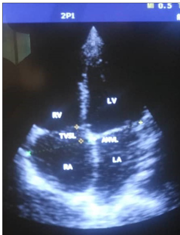
Figure 3. Displaced leaflets of tricuspid valve apically in apical 4-chamber view.

by a minimum of 8 mm/m 2 [7], and that of our patient was 9 mm/m 2 . The clinical features of EA are diverse and sometimes evasive. Right ventricular failure is the usual presentation in pediatrics, whereas adults present with right ventricular failure and dysrhythmia as seen in our patient [4]. No 2 patients with EA have a similar pattern of clinical presentation. Our patient was followed by multiple specialists: a general practitioner and a gynecologist entertained the possibility of Meigs