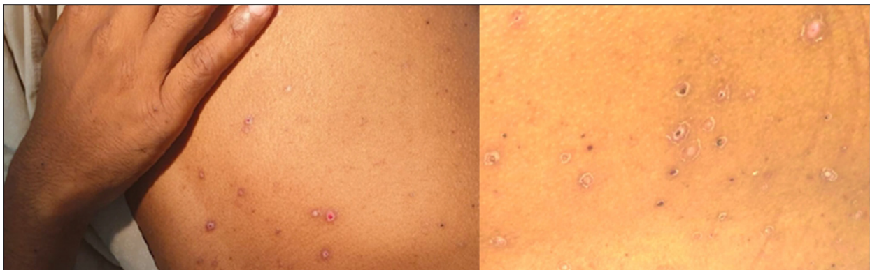
Figure 1. Maculopapular rash and mature vesicles with crusting.

His blood investigations ( Table 1 ) revealed a normal complete blood count, renal function, and liver function tests. However, the laboratory test results were positive for varicella zoster IgG and IgM antibodies. HIV (Human Immunodeficiency Virus) screening yielded negative results. We did not assess D-dimer or perform serology for other Herpesviridae or other viral infections. A plain computed tomography (CT) scan of the head