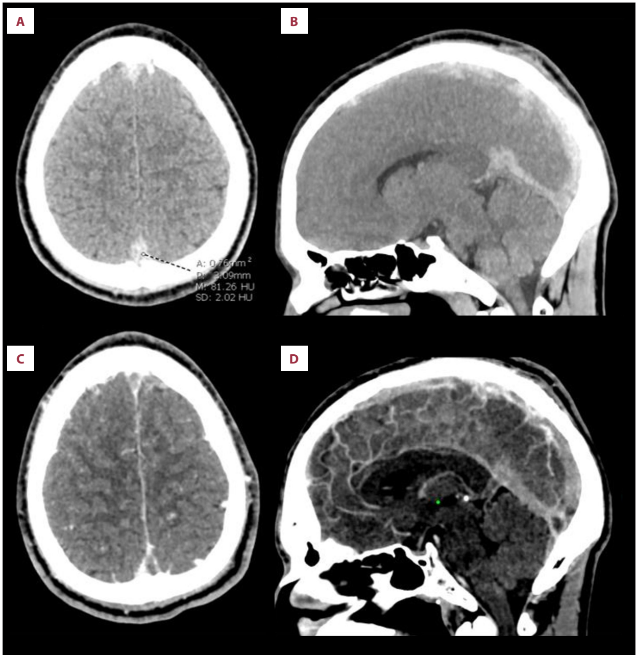
Figure 2. Unenhanced CT brain and contrast-enhanced CT venography. (A) Axial and (B) midline MIP sagittal images from unenhanced CT show hyperdense superior sagittal sinus (CT density of about 80 Hounsfield units), straight sinus and bilateral frontal parasagittal cortical veins concerning for thrombosis. (C) Axial and (D) midline sagittal CT venography images confirm filling defects in the cerebral dural venous sinuses and cortical veins indicative of thrombosis. Thrombosis extended into the transverse and sigmoid sinuses and left internal jugular vein (not shown).