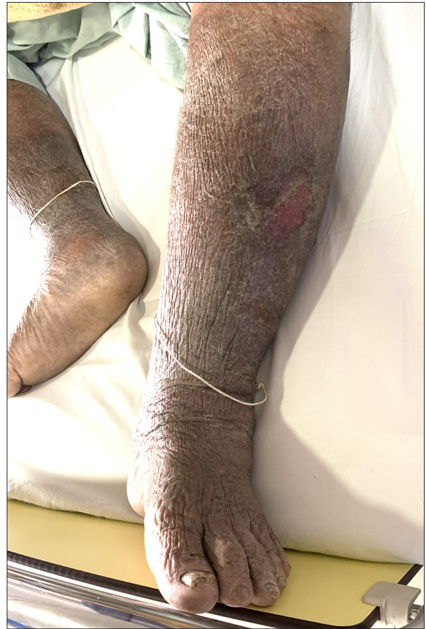
Figure 1. Numerous verrucous folds and cobblestone-like nodules, and plaques and a painless ulcer on the left leg.

A 65-year-old man presented to our hospital’s clinic with a 6-month history of orthopnea and worsening dyspnea on exertion. He also described having worsening leg swelling with painless sores and cellulitis with flaky skin for the past 3 months. His past medical history was significant for chronic left