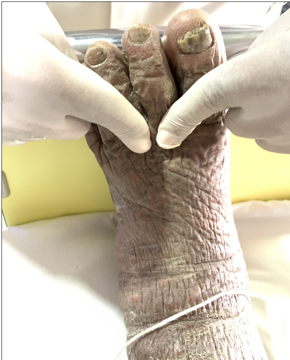
Figure 2. The positive Kaposi-Stemmer sign.

The results of the laboratory evaluation, including blood count, cardiac enzymes, D-dimer, C-reactive protein, metabolic profile, and thyroid function test were normal. Abnormal values included B-type natriuretic peptide levels of 467 pg/mL (reference range, up to 100). Blood cultures showed no organisms. Chest radiograph images showed scattered pulmonary infiltrate with prominent hilar markings, and the electrocardiogram showed a partial left bundle branch block. Echocardiography showed an ejection fraction of 20% and dilated left and right chambers. There was also global hypokinesia with a thinned left ventricle and mild mitral and tricuspid regurgitation. Doppler sonography did not show any arterial or venous clots. Computed tomography angiography showed normal coronary arteries. The patient was admitted as a working diagnosis for dilated cardiomyopathy and presumed elephantiasis of the left leg. A skin biopsy was consistent with stasis dermatitis, and a diagnosis of ENV superimposed on lymphedema praecox with congestive cardiac failure was confirmed.